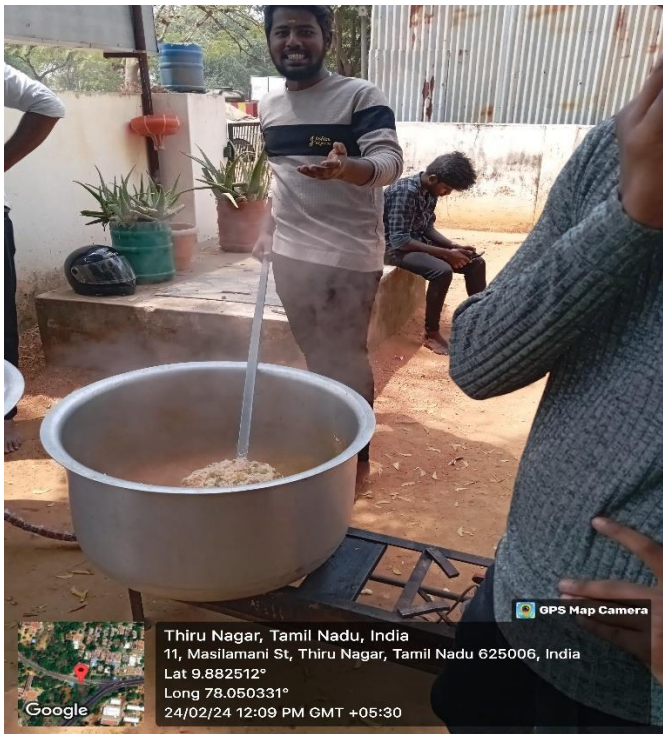
Our Students' Assistance in the Home