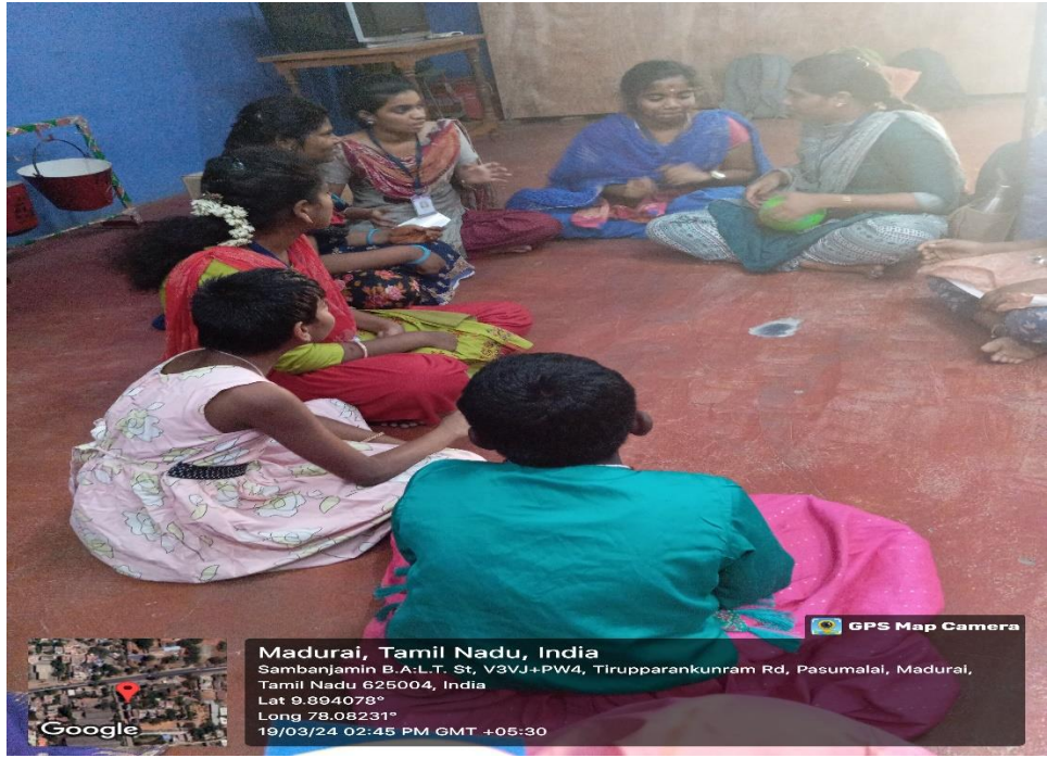
Our Student Volunteers spending their time with the Children of the Home